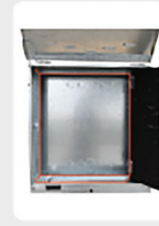
4X Ingress Protection Rear of Panel