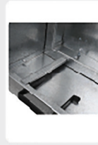
Panel Support Ramp